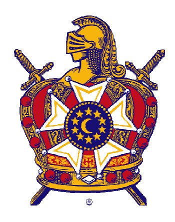
December 19, 2004