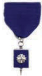
Blue Honor Key